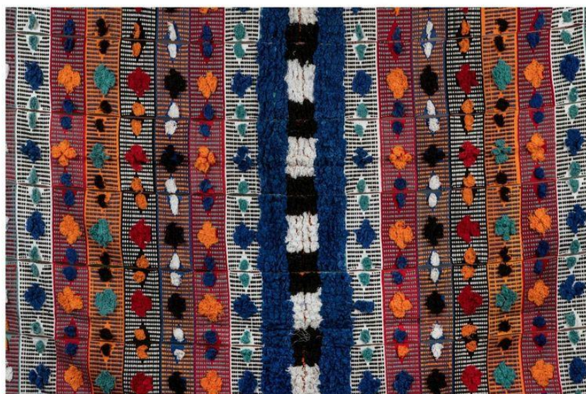
Artist unrecorded, Tuareg, Sahel, Arkilla Munga (Wedding blanket / saddle cloth), c1950, wool, cotton, 178 x 285 cm. Standard Bank African Art Collection (Wits Art Museum). Acquired 2007